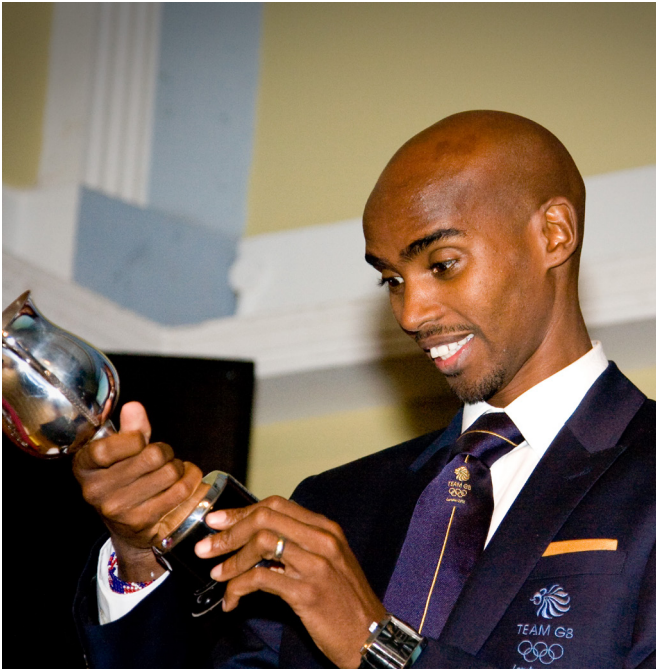
Mo Farah Quadruple Olympic champion long-distance runner

“Teachers plan lessons which motivate and engage the students. Well-established routines help to ensure that in lessons the students are sharply focused on learning. Students enjoy learning and take pride in their work.” CHALLENGE PARTNERS REVIEW